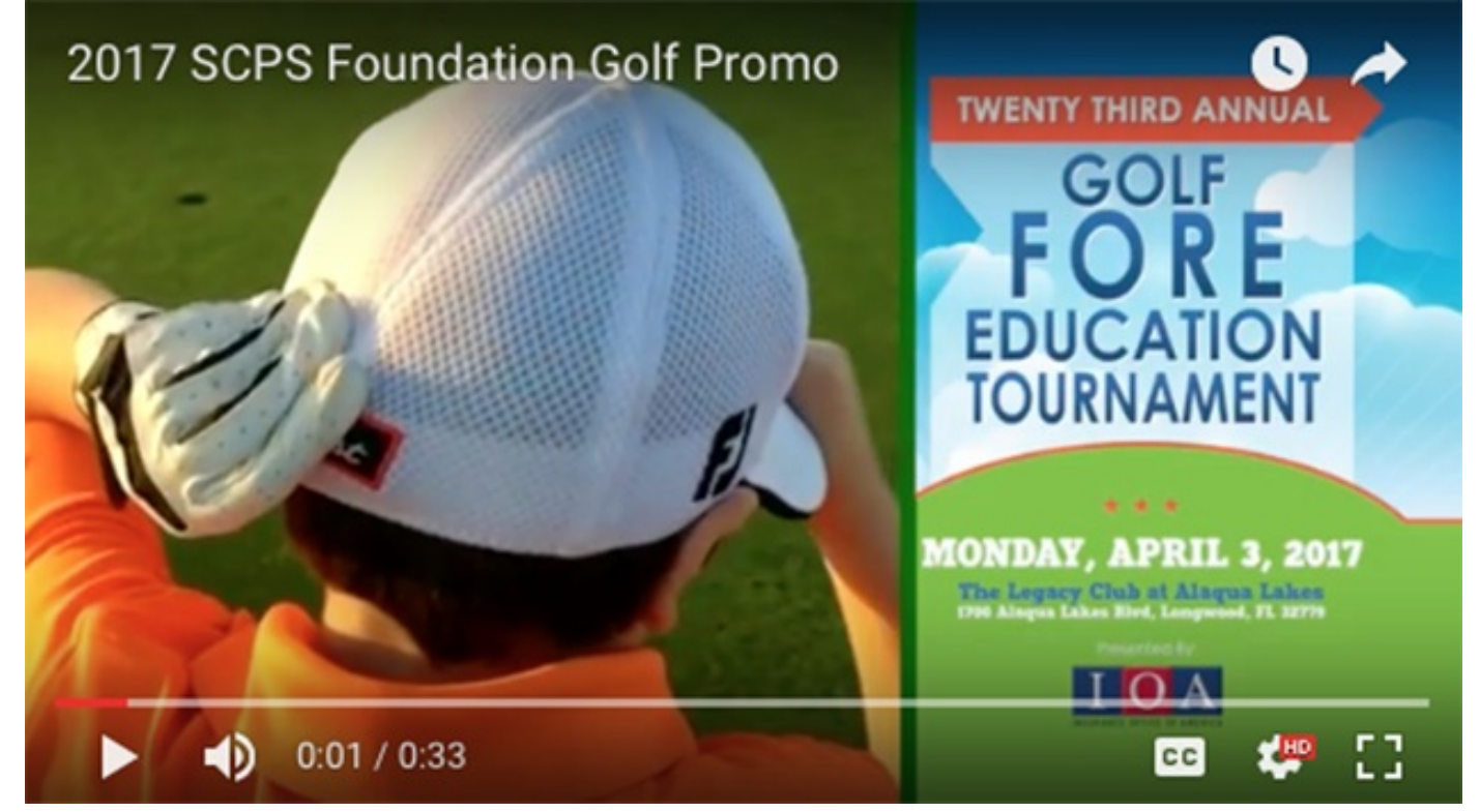
Look for this video as you're watching TV thanks to our Media Sponsor - Charter Spectrum!

Join us Monday, April 3rd at The Legacy Club at Alaqua Lakes for the Foundation's Golf FORE Education Tournament presented by <u>IOA</u>! Not only is it a great way to start your week but also a fun way to support the students and teachers of Seminole County Public Schools. The day will be full of delicious food, drinks, prizes and even a chance to drive off in a new car.