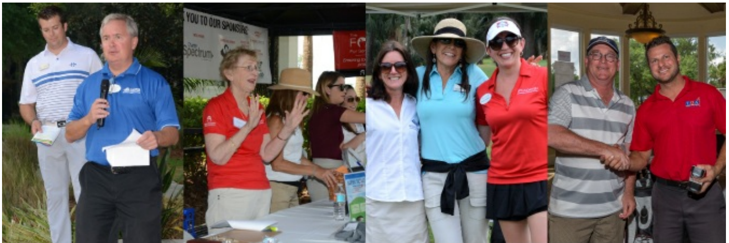
A few of the over 40 volunteers who gave their time at the Golf FORE Education tournament on April 3, 2017.

To learn about volunteer opportunities with The Foundation, visit www.foundationscps.org/get-involved/volunteer/ .